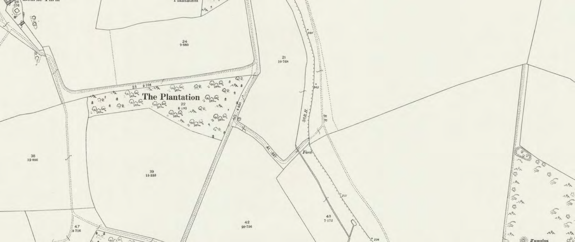
ORDNANCE SURVEY MAP 1902 - EXTRACT FROM SHEET 32.13